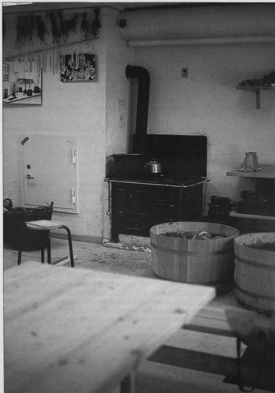
Pogled v eno izmed dveh muzejskih delavnic Danskega kmetijskega muzeja, v tisto s štedilnikom, na katerem otroci med svojim "bivanjem" v preteklosti kuhajo. ♦ View of one of the two museum workshops of the Danish Agricultural Museum, showing the kitchen range on which the children prepare their meals during their "stay" in the past.