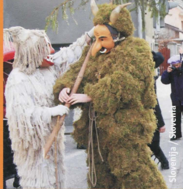
Slovenija / Slovenia