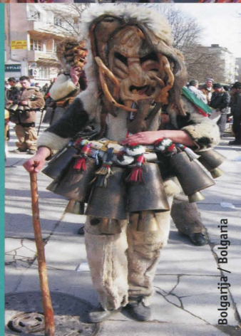
Bolgarija / Bulgaria