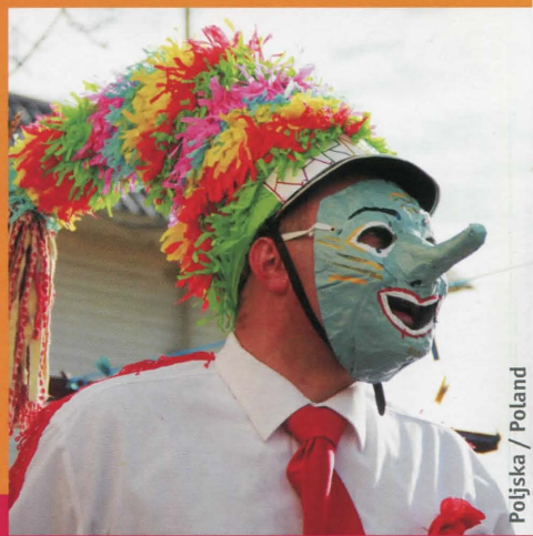
Poljska / Poland