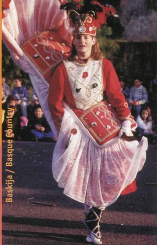
Basquija / Basque Country

created extensive video and photographic documentation on contemporary forms of carnival. They have reported on the results of their work at conferences and published their findings in articles. The project has led to thirty ethnographic films and the film Carnival King of Europe , a comparative presentation of European carnivals as part of winter fertility rites. The material collected in the field provides a solid basis for new interpretations of European carnival customs and for exploring common roots. The exhibition Carnival King of Europe II presents