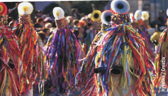
Hrvaska / Croatia