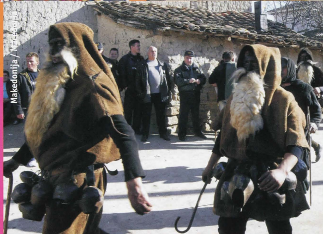
Makedonija / Macedonia